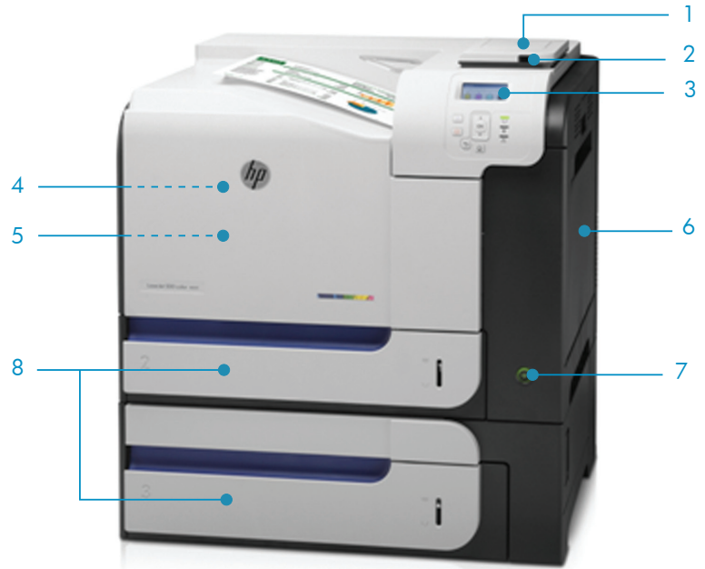
HP LaserJet Enterprise 500 color M551xh printer shown