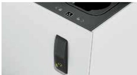
Real-time status on toner level