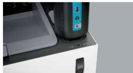
Uses the HP Black Original Neverstop Laser Toner Reload Kit 4