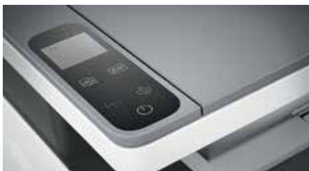
Intuitive user interface