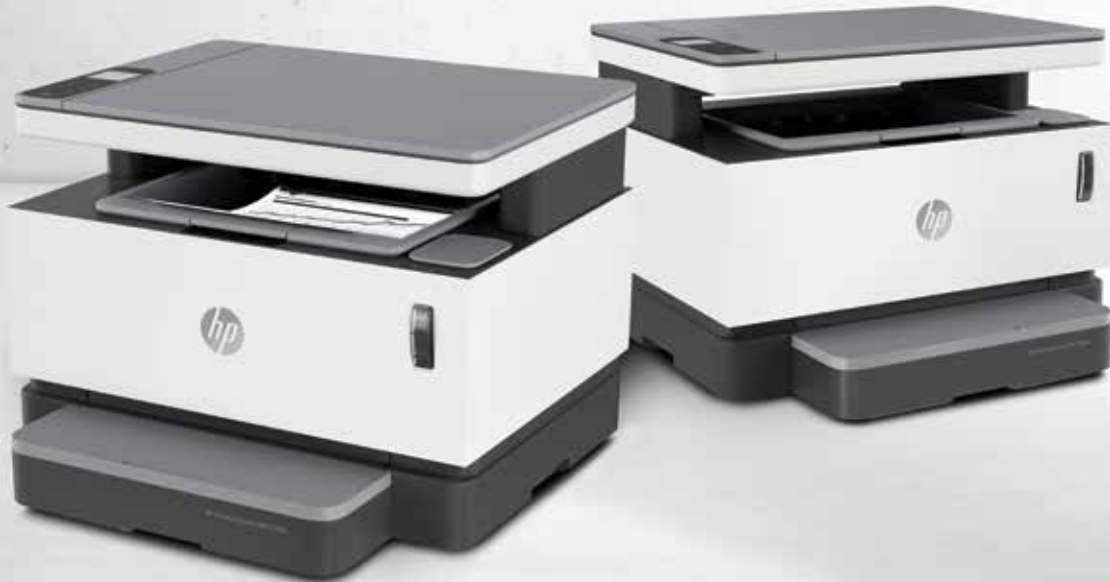
HP Neverstop Laser MFP 1200w 4RY26A

Easily print at high volumes with the HP's first self-reloadable 3 laser printer in class – includes 5,000 pages of toner right out of box before reload. 9 Count on HP quality at an ultra-low cost. Print, scan and copy virtually from anywhere with HP Smart. 2,4,8